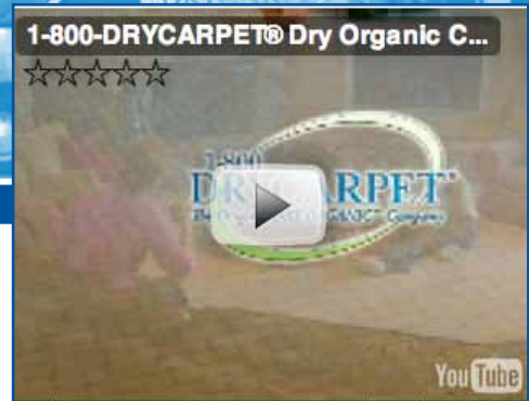
1-800-DRYCARPET® TV Ad - 0:30