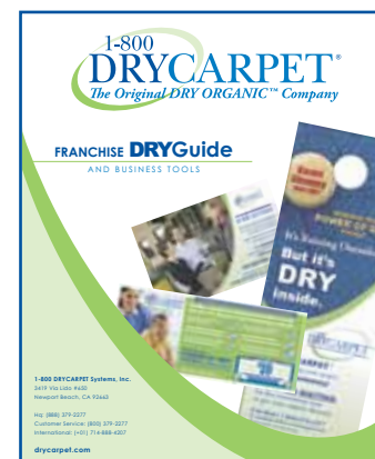
Advertising & Business Tools - DRYGuide.pdf

The way we see it, if you put customers first and believe that "a customer is always right" (even when they are wrong) you should know right now that we are 1-800-DRYCARPET® and we want you!