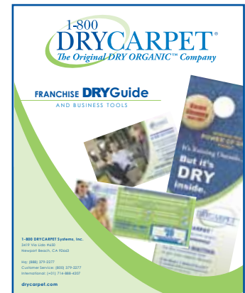
Advertising & Business Tools - DRYGuide.pdf

All we ask is that you are motivated to be successful, have the right attitude, work hard and have a vision for growth.