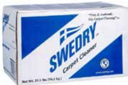
Our proprietary professional products are only available to those in our system

Unlike our competition, our DRY ORGANIC™ system does not flush water, detergents and/or chemical based solvents through carpet, better yet, carpet is not wet for hours/days. Out dated, old fashioned processes such as Steam Cleaning, Shampooing (today sometimes referred to as “Dry Encapsulation” and/or “dry Foam”) typically lead to re-soiling, matting, crunchy and uglified-out carpet over a relatively short period of time. Conventional wet and/or pseudo “dry” carpet cleaning (when the core product is a liquid) can also dilute and remove valuable stain-resistant materials and crush resistant properties from carpets.